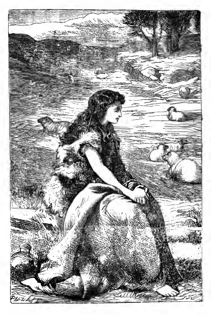
Joan of slic tending her Flock.